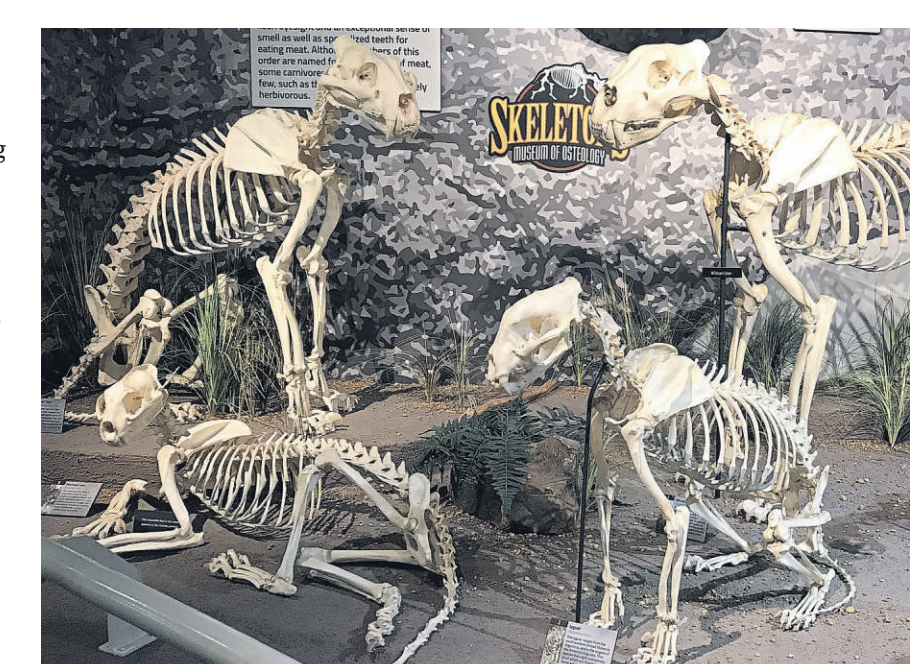
Skeletons: Museum of Osteology, is an educational display of over 500 skeletons.

Back on International Drive, we decided to take in more of the attractions at ICON Park. If I were to come back with family I would definitely do repeat visits to at least two of the attractions. Everyone should visit the