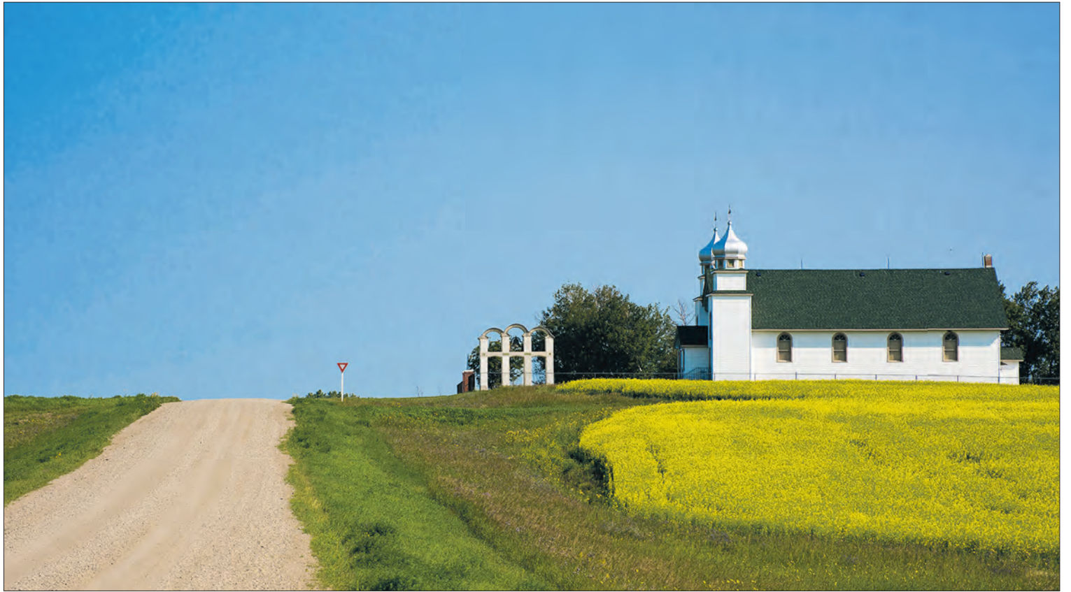
Fish Creek Road is one of the backroad routes that can be used to get off the beaten path in Saskatchewan. This road is part of an alternative way to travel between Saskatoon and Prince Albert.

Our favourite backroads route is Fish Creek Road, which follows the South Saskatchewan