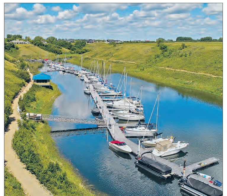
The Elbow Marina can be found on Lake Diefenbaker, just off Highway 44.