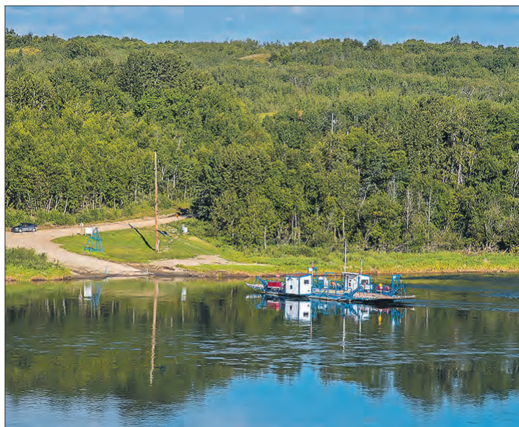
The St. Laurent Ferry is a worthwhile detour to visit the historic site of St. Laurent.

River much of the way. Begin by heading northeast of Saskatoon on Highway 41. About 10 kilometres past Aberdeen, turn north onto Fish Creek Road. The route takes us past onion-domed heritage Ukrainian churches, then beside the Fish Creek Battle Site where the first battle was fought in 1885 between the Canadian militia and Metis led by Louis Riel.