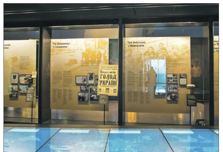
Genocide is one of the topics that the museum tackles.