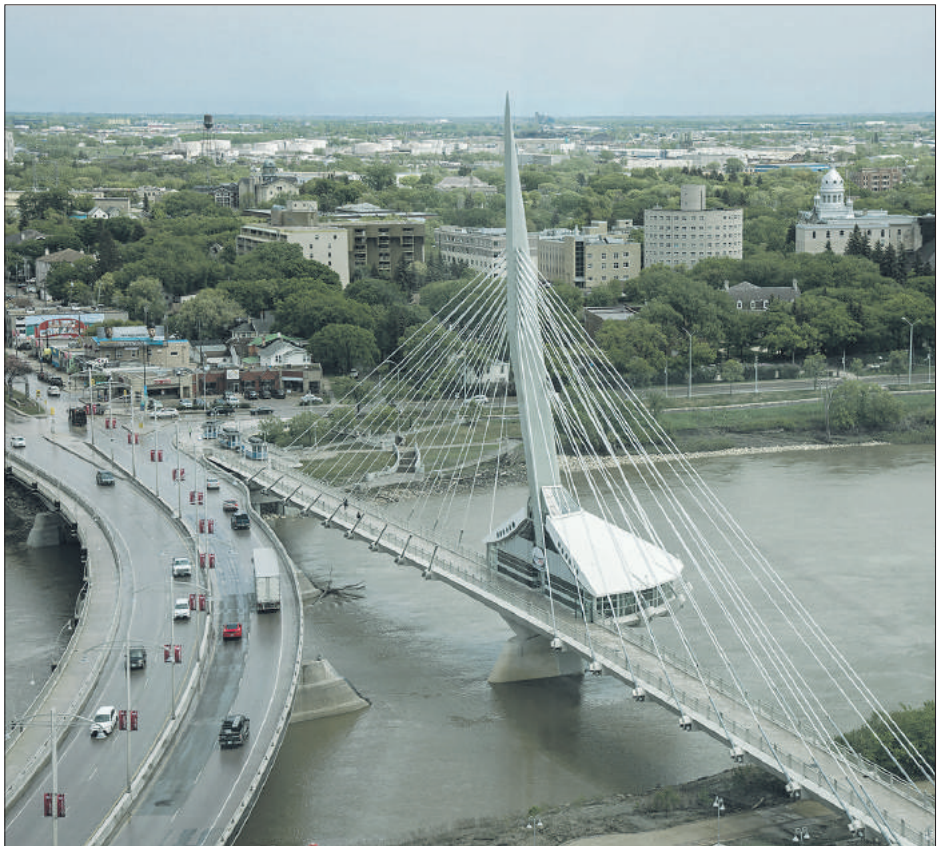
The museum's Israel Asper Tower of Hope provides sweeping views over downtown Winnipeg, left, and historic St. Boniface.

One exhibit features Viola Desmond, a black woman from Nova Scotia who was arrested because she defied discrimination by sitting in the whites-only section of a racially segregated movie theatre. The new $10 bill now features her portrait, along with the CMHR.