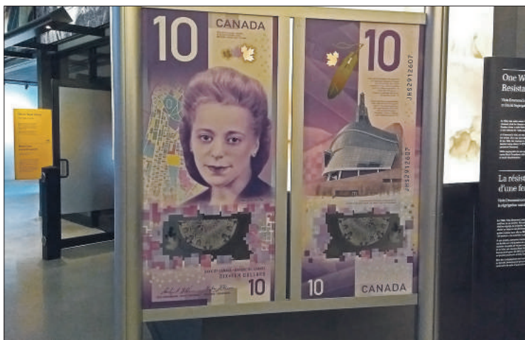
The museum appears on Canada's $10 bill along with Viola Desmond.