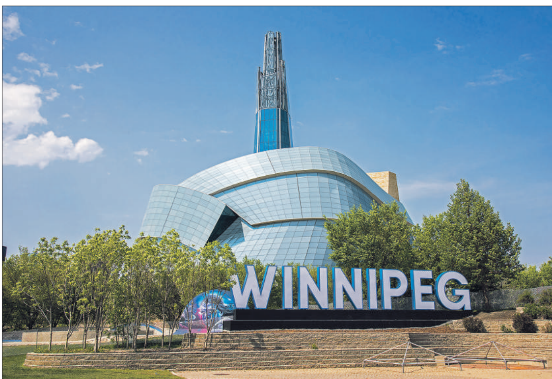
The museum boasts distinctive architecture both inside, top and out.

A large part of the museum is devoted to Canada's experience with human rights, both good and bad. Canada has been a leader in human rights legislation but has also gone through numerous negative episodes such as the expulsion of the Acadians, internment of Japanese Canadians during the Second World War and the abuse and attempted assimilation of First Nations peoples at Indian residential schools.