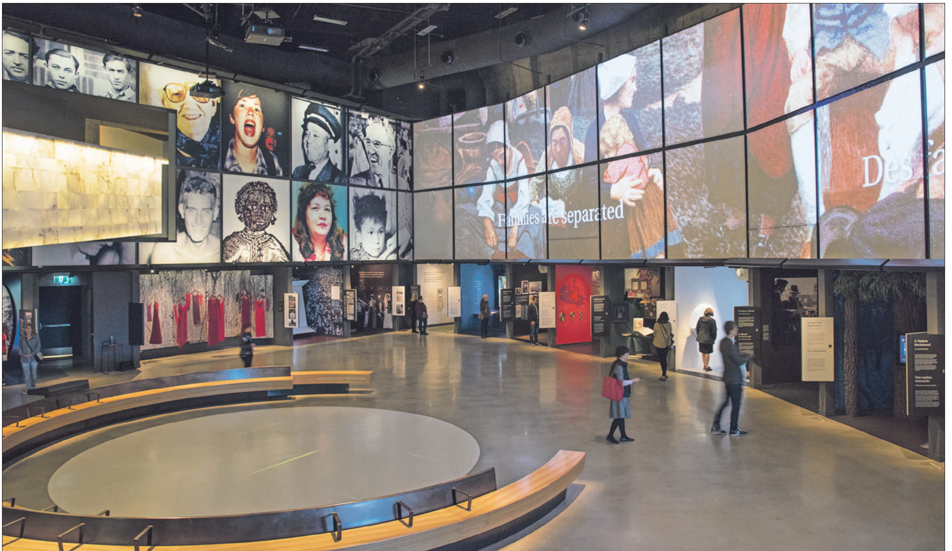
The Canadian Museum for Human Rights is the only national museum outside the National Capital Region around Ottawa.