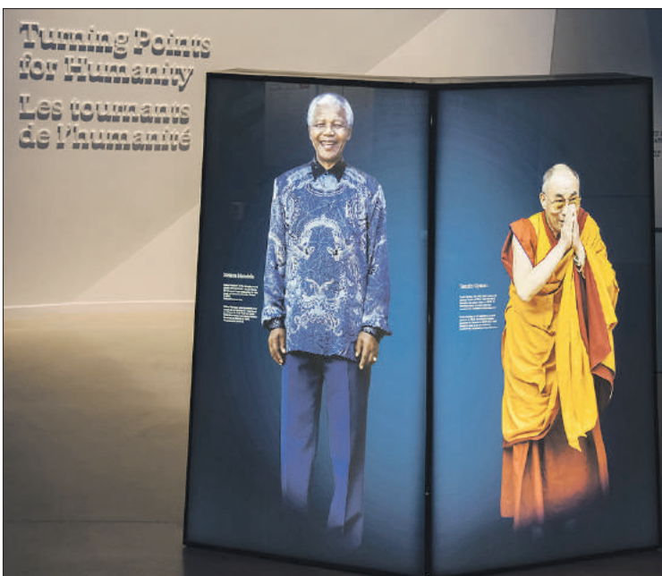
Key personalities in the struggle for human rights are highlighted.