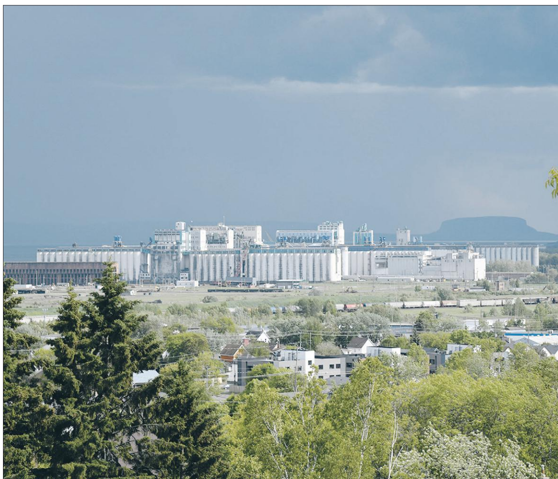
Thunder Bay's port and grain terminals give the city a rich agricultural history.