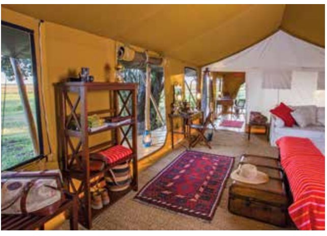
Travelers to Africa can balance the rugged safari experience with upscale, comfortable accommodations. The Elewana Collection includes luxury camps and lodges that are carefully sited to ensure guests have prime viewing of local wildlife.

and typically includes a group of less than 18 guests. Participants enjoy views of a menagerie of wildebeests, cheetahs, rhinos, hyenas, gazelles, giraffes and more, all from a prime window seat.